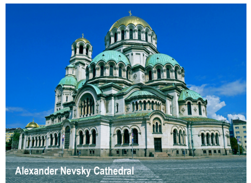
Alexander Nevsky Cathedral

Hotel : Festa Barcelo Hotel or similar (B/D)