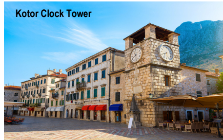
Kotor Clock Tower

Coach to Kotor, a well preserved medieval town in the southern part of Montenegro and also a UNESCO Heritage Site. A walking tour will show you all the places of interest that the city can offer or join an optional tour to Our Lady of the Rocks by boat. Later, onto Dubrovnik, Croatia, the pearl of the Adriatic for overnight stay. Hotel : Valamar Lacroma Hotel or similar (B/D)