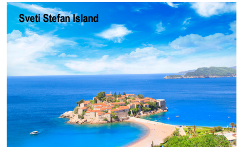
Sveti Stefan Island

After crossing the Drina river by the border, a full-day drive will take you from Sarajevo to Belgrade, the capital of Serbia, for overnight stay. Hotel : Holiday Inn or similar (B/D)