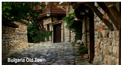
Bulgaria Old Town