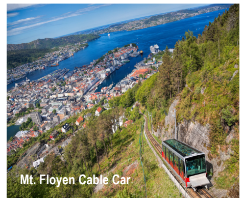
Mt. Floyen Cable Car