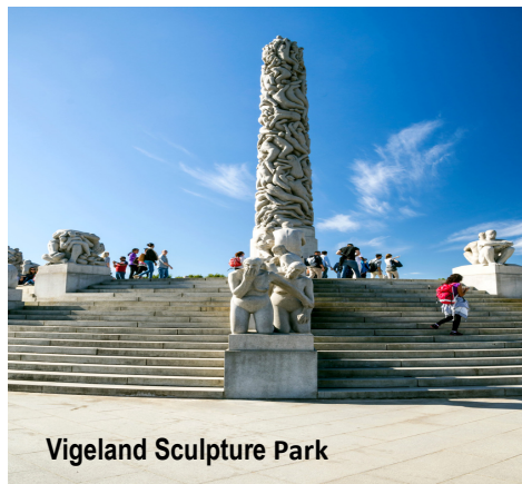
Vigeland Sculpture Park