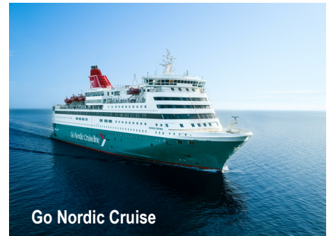
Go Nordic Cruise

Hotel : VoringFoss Hotel or similar (B/D)