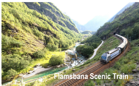
Flamsbana Scenic Train

Hotel : Loenfjord Hotel or similar (B/L/D)